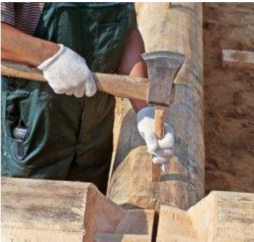
Figure 4. Construction of log house without dowel