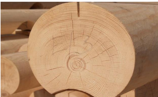
Figure 2. Round logs of pine

Round logs of pine is shown in Figure 2.