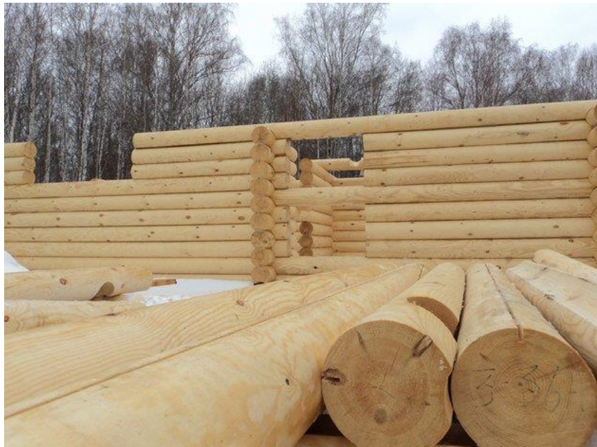
Figure 3. The construction of a dwelling house of logs

Based on the above advantages, it can be concluded about the cost of the house. Despite the expensive material, the house made of logs allows you to save on heating and air conditioning on no need for decorating, to the foundation, as well as save on construction of house because of the simplicity of its construction.