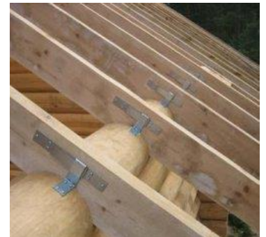
Figure 5. Attaching the rafters

Attaching the rafters is shown in Figure 5.