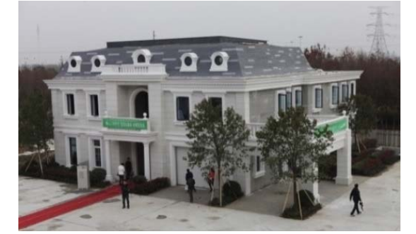
Figure 1. 3D printed villa by «Sanghai WinSun» company [11]

Initially, 3D printring technologies were considered suitable only for the urgent construction of a temporary dwelling [10]. Scenarios for the development of this technology were considered in detail by Sergei Zotov [11].