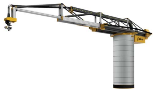
Figure. 2. Apis-Cor 3D building printer (2016) [15]

According to the company's representatives, in the course of the experiment, savings achieved are about 60% of building materials and about 30% of the time, required to build a similar facility, using traditional methods. Furthermore, the composition of the construction team was reduced by five times, which means savings and a reduced risk of work-related injuries. The material used was a mixture consisting of cement, glass fibre reinforced fibreglass reinforced plastic, sand and a special hardener. The walls of such houses are almost hollow, and the strength and stability of the structure is given by the zigzag feeding of the mixture inside such walls [13].